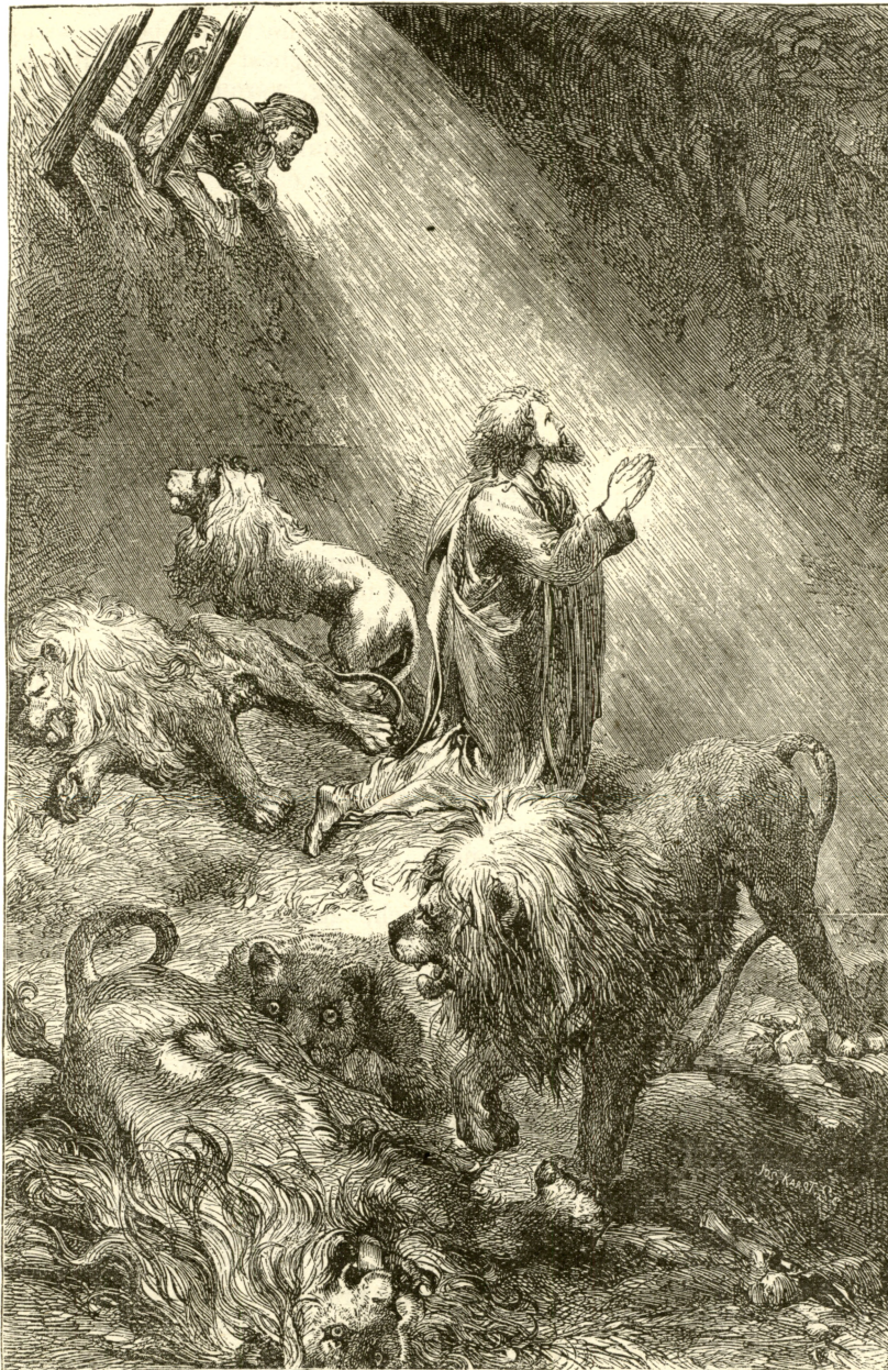
Daniel, the First of the Three Presidents, in the Lions' Den.

When their education had been completed the king communed with the young men who had been selected for